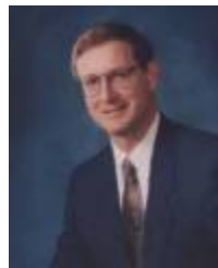
Speaker for the Dinner Meeting: